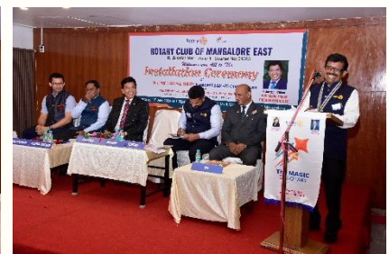
Acceptance speech by the President