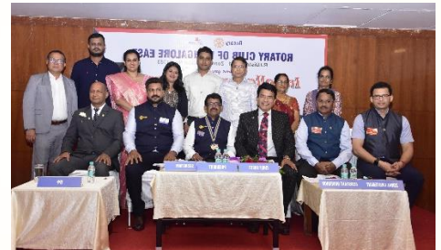
4 New members joined