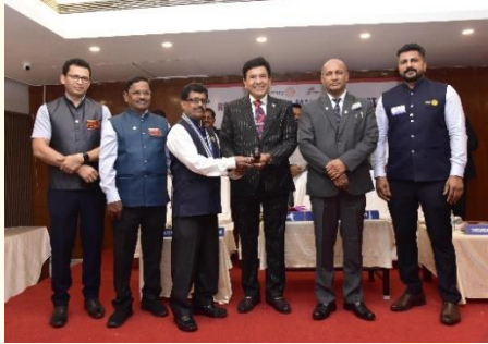
Installation of New President