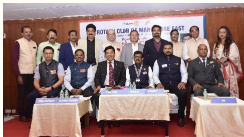
Chair Persons 2024-25