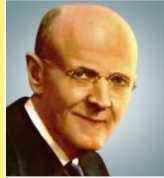
Rtn Paul Harris Founder of Rotary