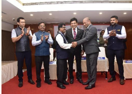
Handing over of Charge