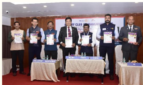
Release of monthly Bulletin Disha