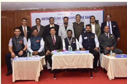
Board of Directors 2024-25