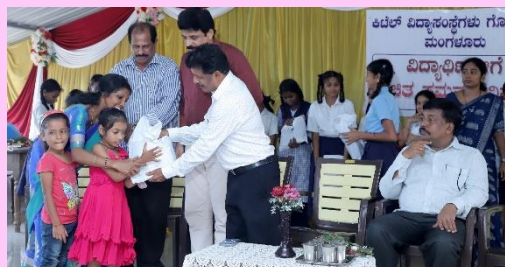
Uniform distributed to students of Kittel Memorial School Gorigudda Mangalore joint Programme with Red Cross Society Mangalore